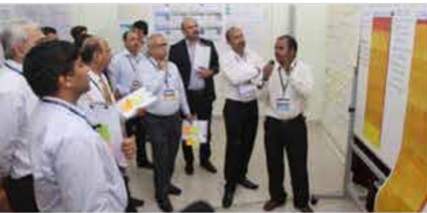
Interaction of participants of 'Water for All Lab', Mumbai, May 2014

“The lab provides a good forum for ideation and hearing of silos. It gives excellent opportunity for value addition to all participants. It’s a great chance to be a part of history, as this is a “never-before” exercise & fantastic learning process.”