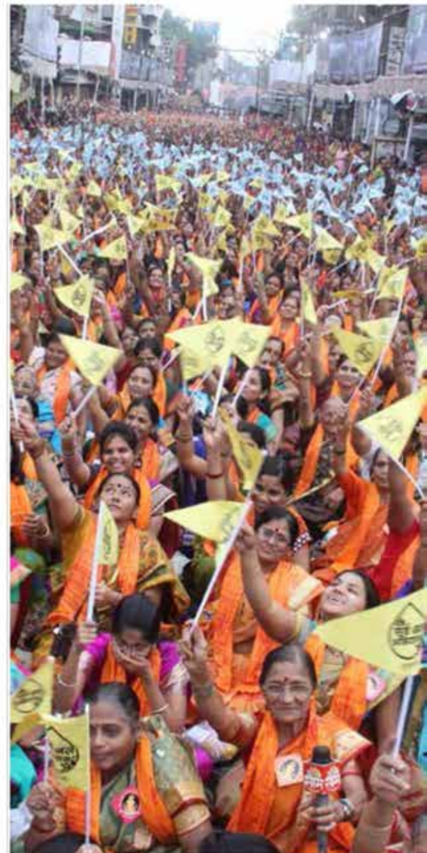
Grassroot support during the Water For All initiative, Pune, August 2014

"I have contributed a lot for water sector, but this is the first time I saw a ray of hope."